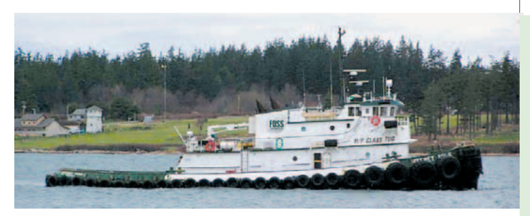
The Jeffrey Foss will be on station at Neah Bay beginning in July 2010.

Beginning this July, the Jeffrey Foss will be assigned to Neah Bay. The Jeffrey is a 112-foot, 70-ton bollard pull, high-performance ocean-going tug built in 1970 at McDermott Shipyard